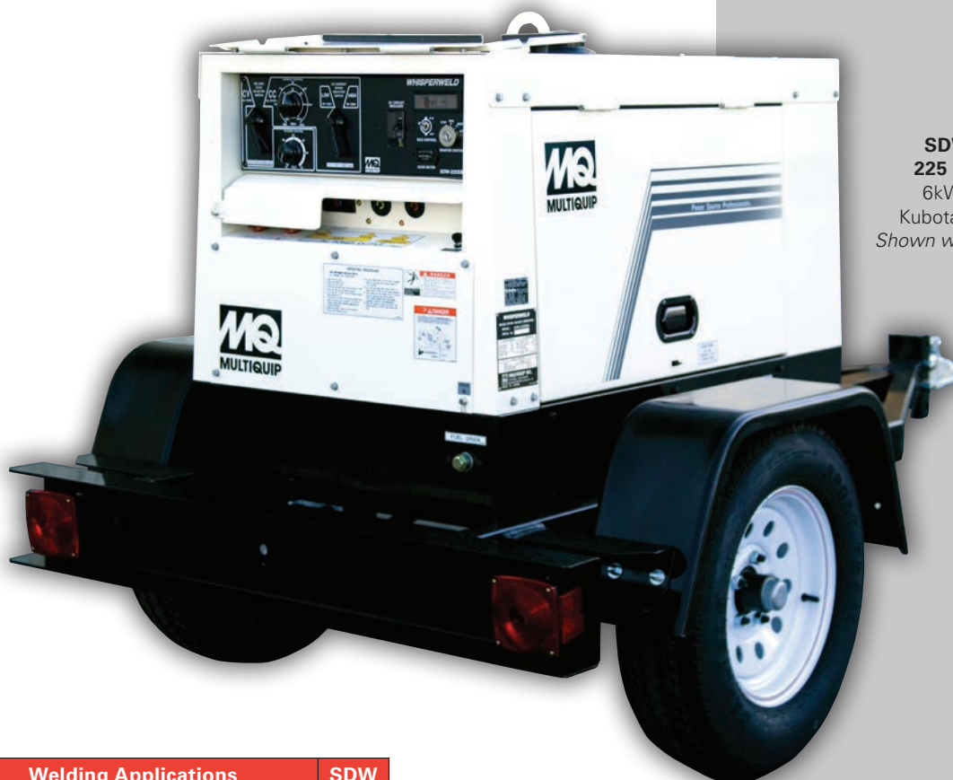
SDW225SSA1 225 amp welder 6kW AC output Kubota diesel engine Shown with optional trailer

Full instrumentation is protected by a lockable cover panel. Controls for both CC and CV welding, along with engine condition indicators, are included.